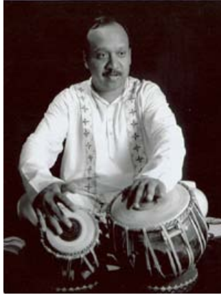
Tabla classes and concert information are now available.